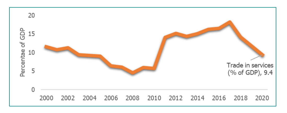
Figure 3: World Bank Estimates of Trade in Services as a Percentage of GDP for Trinidad and Tobago

The path towards economic diversification for Trinidad and Tobago must include the active involvement of the services sector. The TTCSI hereby presents the recommendations that will lay the foundation for growth of the services sector specifically the development of export led strategies for the services sector. These recommendations will be categorized into the following areas: